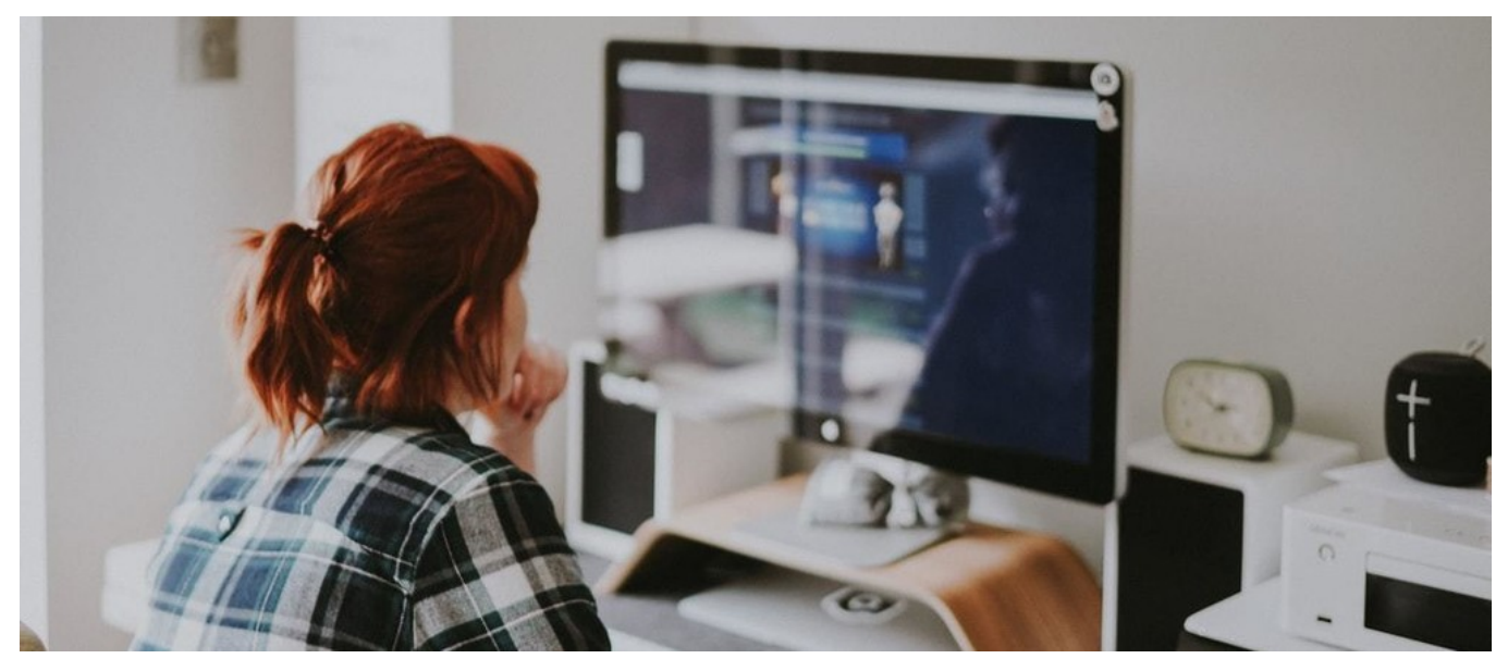
It is vital we redefine our working environment, so that we can still foster and benefit from weak-ties.